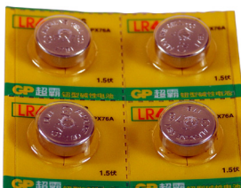
606118 replacement batteries (includes battery cover).