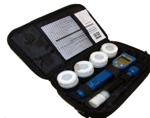
605129 soft carrying case.